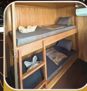
Bunk Bed Single IDR 4.050.000/Pax