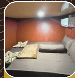
Private Cabin Down Deck IDR 3.800.000/pax