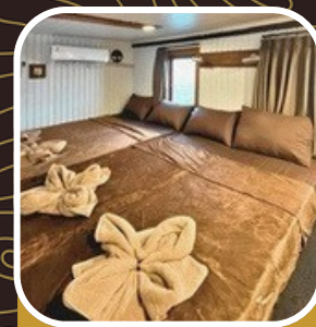
Sharing Cabin ID R 3.300.000/Pax