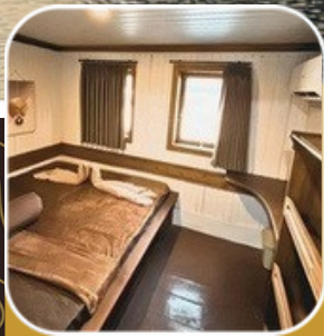
Deluxe Cabin IDR 4,800,000/Pax

Departs every TUESDAY Secure your spot now!