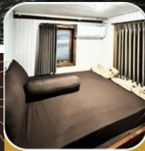
Standard Cabin IDR 4.550.000/Pax