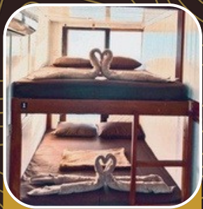
Bunk Bed Double IDR 3.300.000/Pax